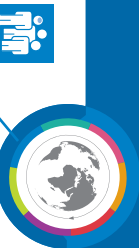
Table 1 (cont.)